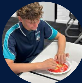
Year 8 Tectonic Plates