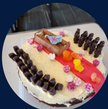
Cake - Queen