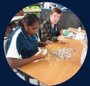
Crafting for Charity