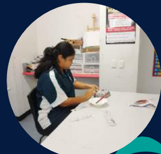
Crafting for Charity