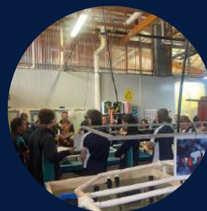
Testing Nutrient Levels