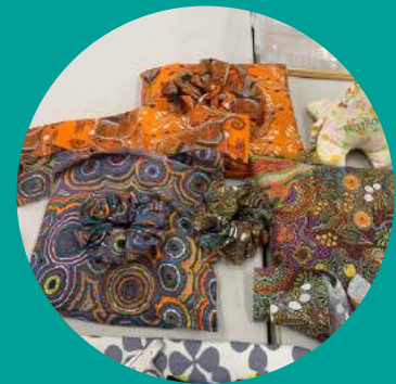
Self-Care Heat Packs

Our students learnt about basic sewing skills and basic ironing in our workshop. We ended the day with heating our beautiful bags that had been scented with lavender or lemon grass oil for a 15 min guided relaxation.