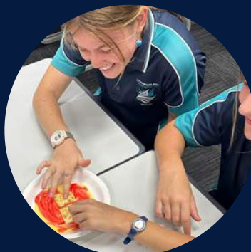
Year 8 Tectonic Plates