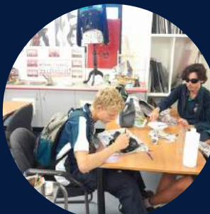
Crafting for Charity