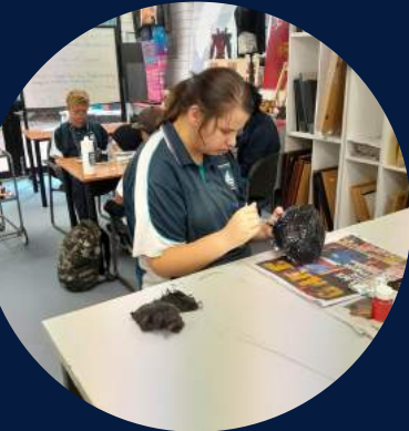
Crafting for Charity