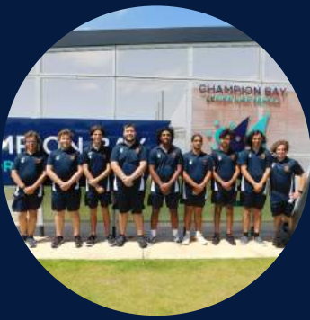
Clontarf 2023 Year 12's

We look forward to 2023 and all it has to bring. As we navigate the year, we will watch on and help develop the lads as best we can, because we all know, From Little Things Big Things Grow.