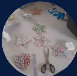
Crafting for Charity