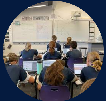
Year 12 Economics ATAR