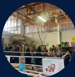
Taking Water Samples