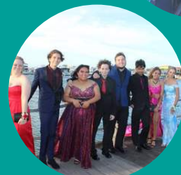
Year 12 Ball