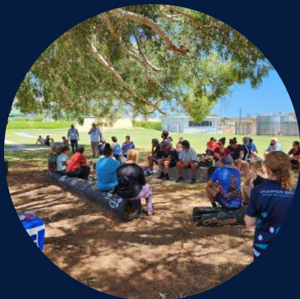
First School Development Day organised by our AIEO's

First day for students in Term 2 is Wednesday 26 April – please 'top' up stationery to start Term 2