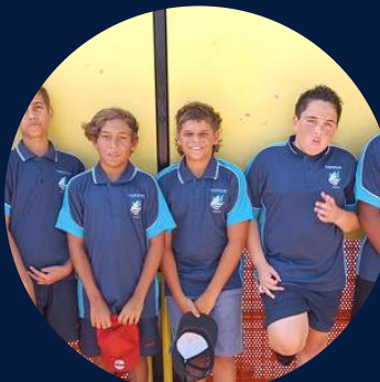
Year 7 Induction