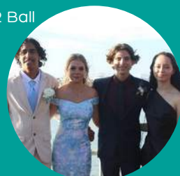
Year 12 Ball