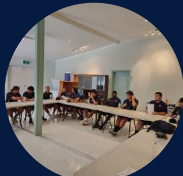
Signing of the Pledge