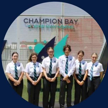
2023 Year 12 School Leaders in Formal Uniform