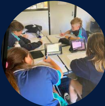
Year 9 Group Work