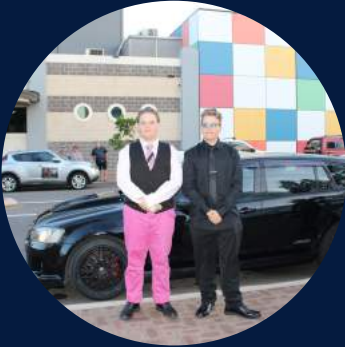
Year 12 Ball