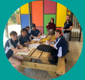
Year 11's being Resilient during the recent power outages, still completing maths.