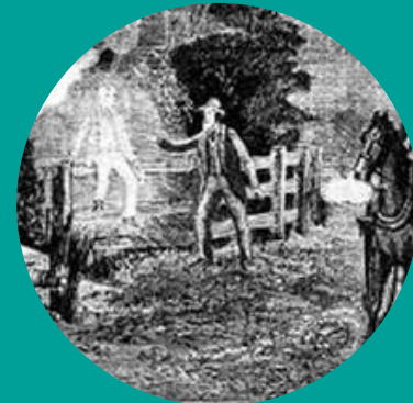
Australian Ghost Story