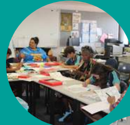
Connection to Culture

Monday to Thursday afternoon sessions 3:00pm to 4:30pm (Senior students have the option to tutor until 5:00pm)