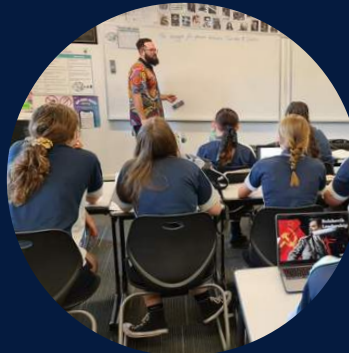
Year 12 Modern History ATAR