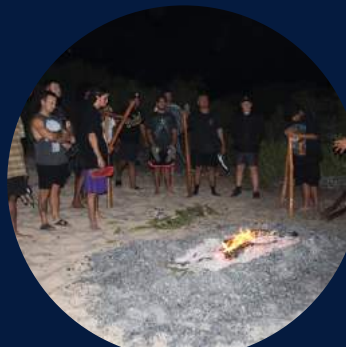
Dreamtime Didgeridoo Tour