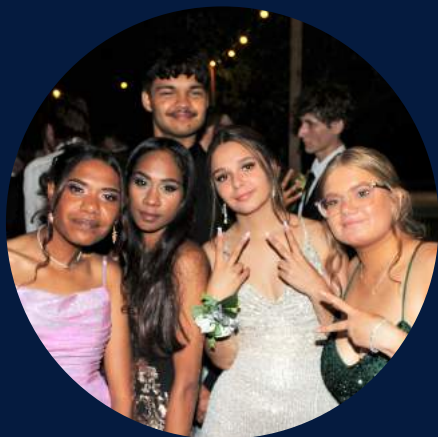
Year 12 Ball