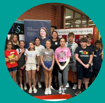
Young Writers Workshop