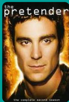
Neither is he