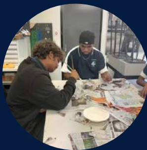
Crafting for Charity