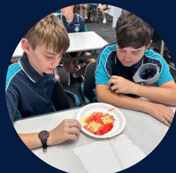
Year 8 Tectonic Plates