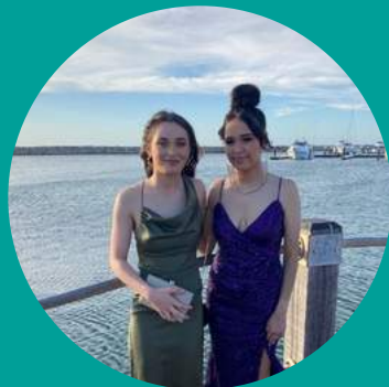
Year 12 Ball