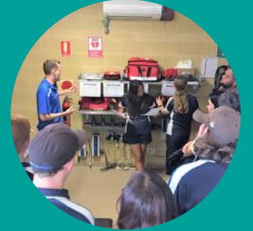
Yr 11 Sport & Rec - Aquarena