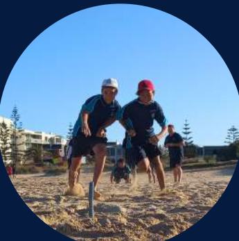
Year 7 Induction