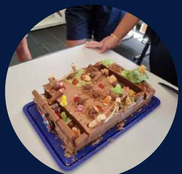
Cake - Civil War