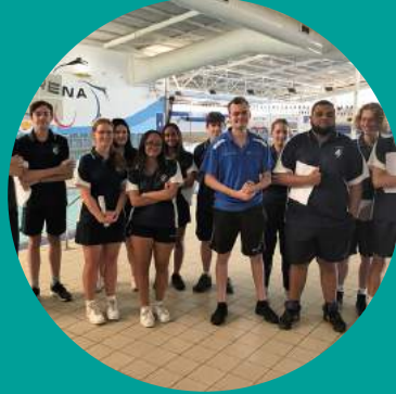
Yr 11 Sport & Rec - Aquarena