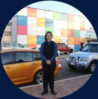
Year 12 Ball