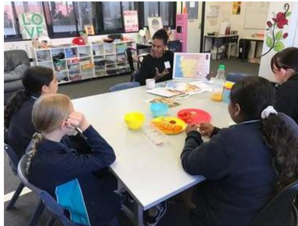
Year 7/8 Discussing local Indigenous history, visiting the Geraldton Regional Art Gallery to view the Tharlbarra birli barna Exhibition.