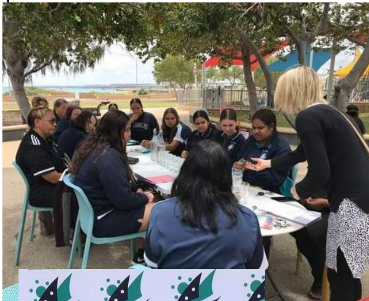
Year 9 10 Participating in WA Centre for Rural Health's Mindfulness Program.