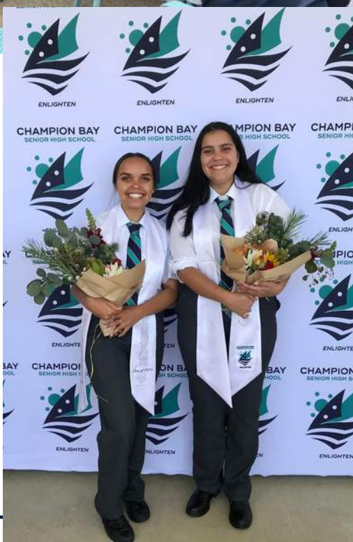
Not saying goodbye but see you later with our first Deadly Sista Girlz Champion Bay SHS year 12s.