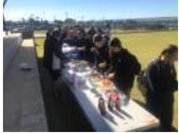
Year 10's enjoying a SOTW Lunch