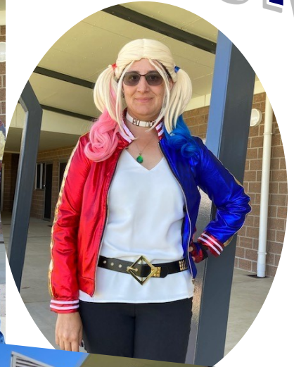
Dream Job Dress Up Day