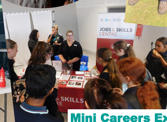
Mini Careers Expo