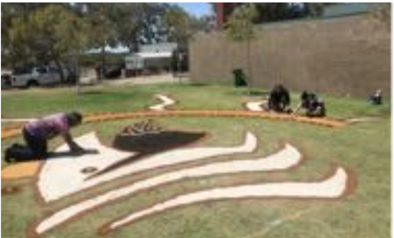
Sand art at NAIDOC week.