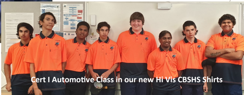
Cert I Automotive Class in our new Hi Vis CBSHS Shirts