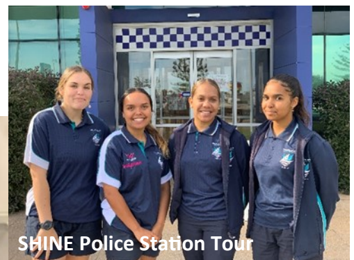
SHINE Police Station Tour