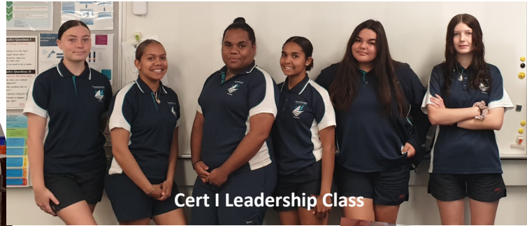
Cert I Leadership Class

This term approximately 25 of our students commenced training with TAFE and Vocational Training Services (VTS) under the Aboriginal School-based Training Program. The Year 10 students are studying a Certificate I qualification in Automotive or Leadership and the Year 11 students are studying a Certificate II qualification in Leadership.