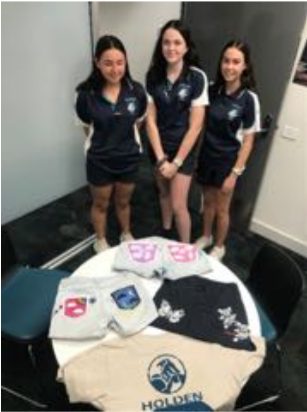
Year 10 Art Students with screen printing

As I reflect on just how busy and productive term 3 has been, I would like to thank and acknowledge all of the hard work that the amazing staff and students have put in at Champion Bay Senior High School. I have been fortunate enough to visit classes from every Learning Area over the Term and see the students aspiring to be their best. It has also been great to observe the year 10's continuing to mature as they move towards a Senior School pathway through OLNA, Course Counselling and School-Based Traineeships.