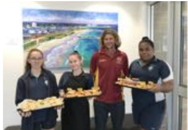
Year 10 Champions at Work on RUOK Day